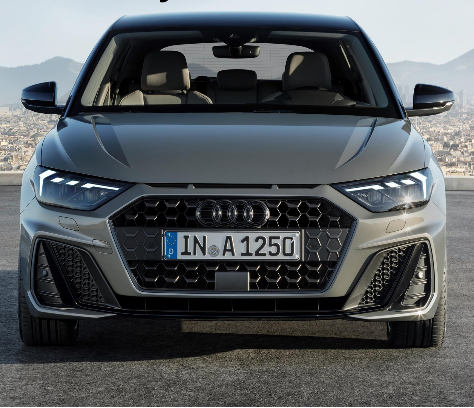
Image shows vehicle from the production year 2018 with optional equipment