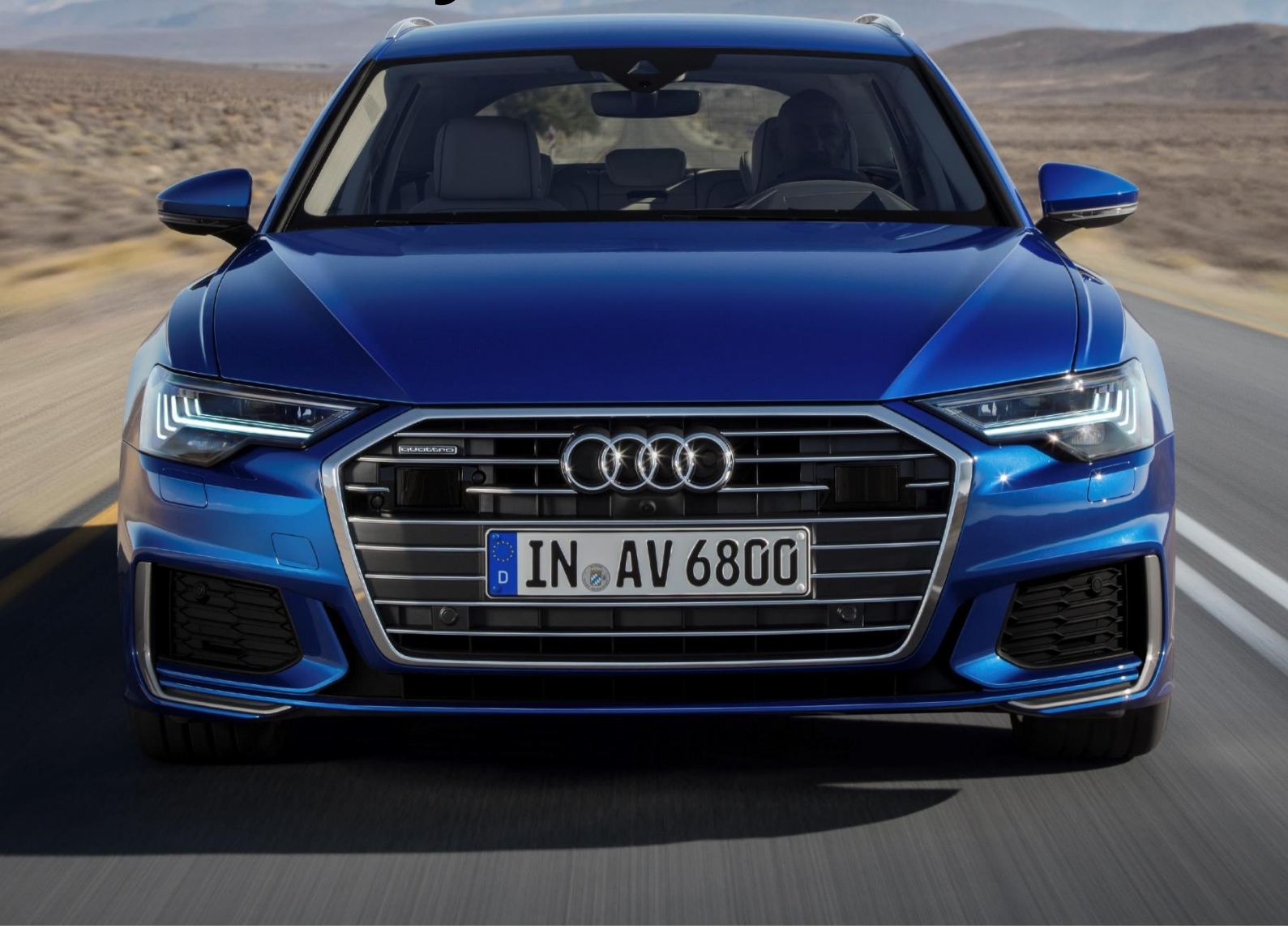
Image shows vehicle from the production year 2018 with optional equipment

Audi A6 Avant 45 TFSI quattro S tronic* The life cycle assessment