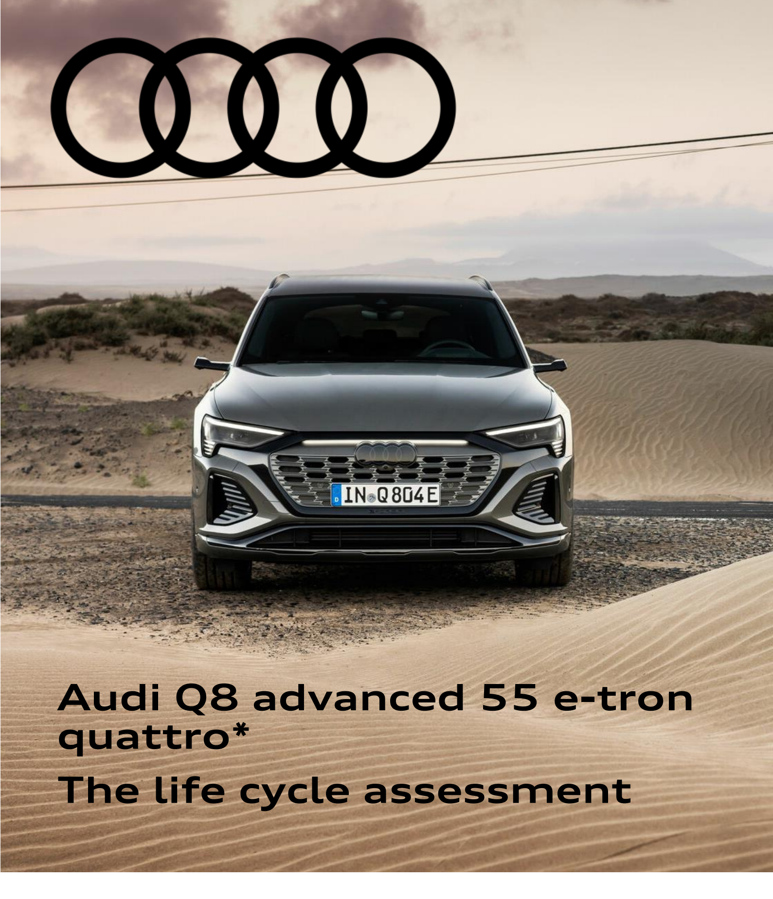
Image shows vehicle from the production year 2022 with optional equipment