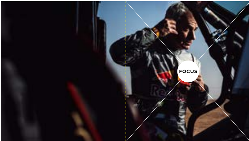
Right side = Image focus

Make sure the image you selected respects the defined parameters