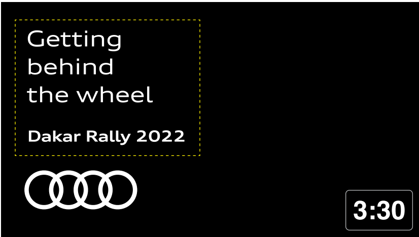
Three lines headline + Playlist name

Customize the text based on your needs and make sure it fits to the maximum lines allowed